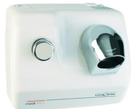
SC0088H White enamelled coating