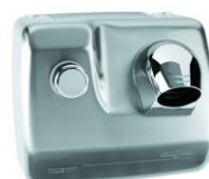
SC0088HCS Satin chrome